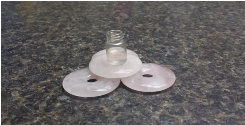
Figure 1: Exposure system for DNA solution to EE medallions

The data was transferred to an Excel spreadsheet for analysis. Due to a phenomenon known as frequency hopping (Drichko 2000), the amplitude (strength) of the induced current response at a given frequency cannot be measured as with normal spectroscopic techniques. Therefore, how often the induced signal appeared, percent occurrence, at each excitation frequency was measured and used to obtain the intrinsic frequencies of DNA. The percent occurrence is a measure of signal strength at each frequency.